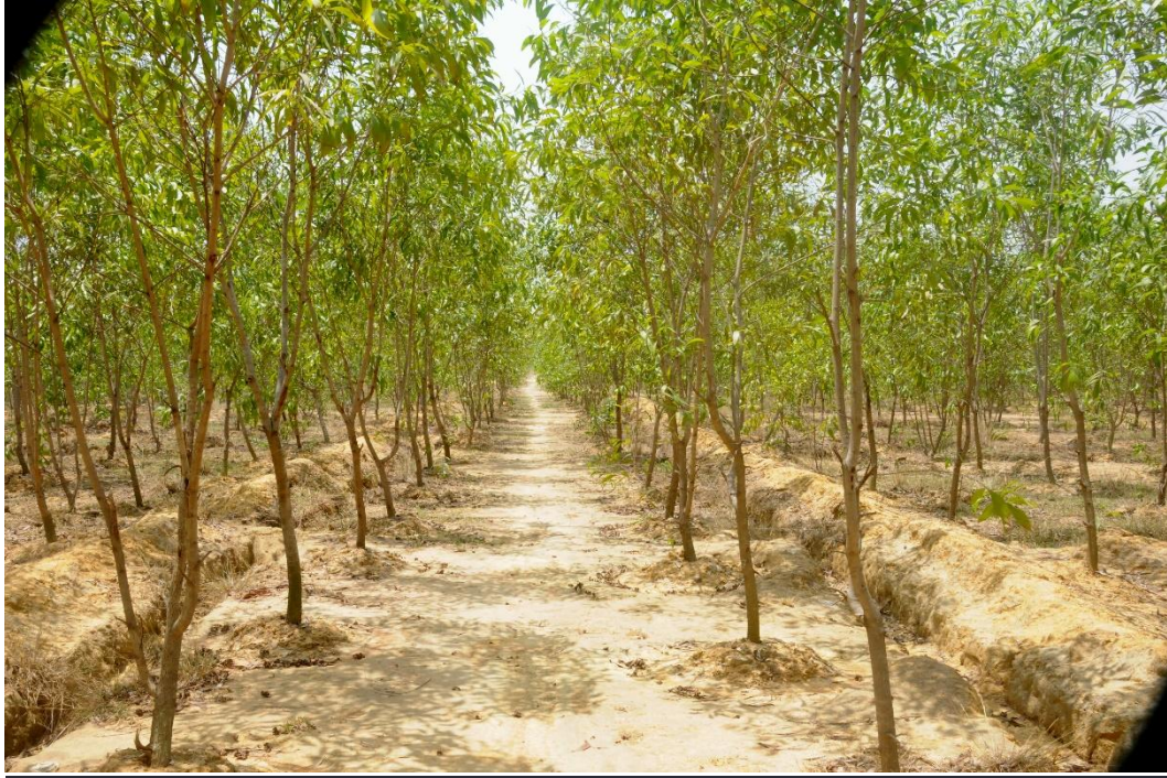
A3 Model 2016 Plantation