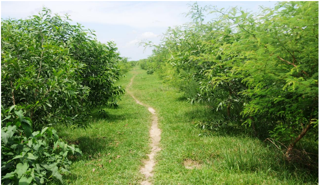
2016 Plantation B1 Model at under Raiganj DMU