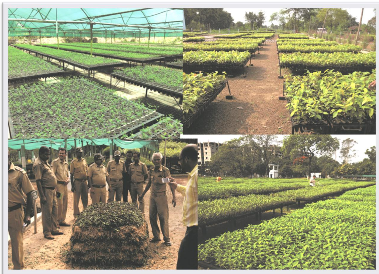
Central Nurseries under Different DMUS- (2016-17)

In the year 2016-17, 2.25 units of New Central Nurseries & 2.75 units of upgradation of existing Central Nurseries have been completed & production of QPM has been started at these units. Thus, under the Project, targets of 24.75 units of New Central Nurseries and for expansion of 15.25 units of existing Nurseries have been already established.