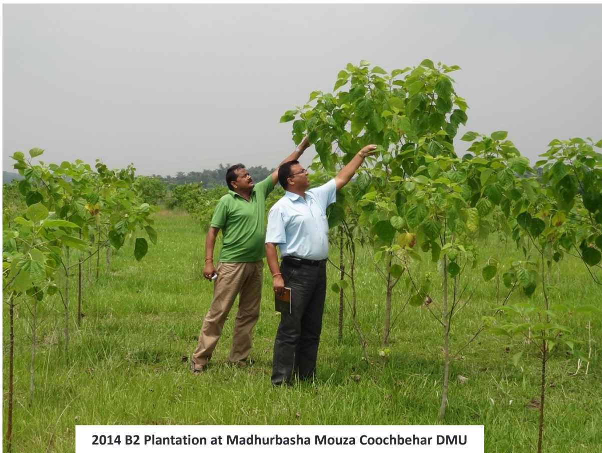
2014 B2 Plantation at Madhurbasha Mouza Coochbehar DMU