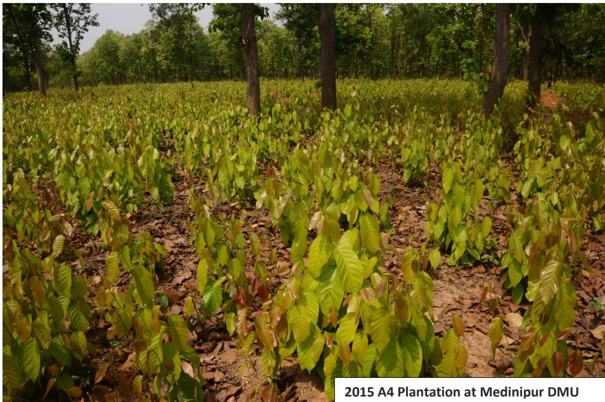
2015 A4 Plantation at Medinipur DMU