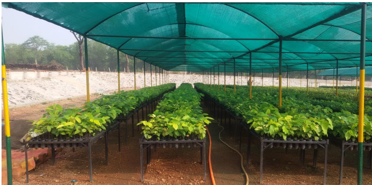
Sal seedling kept under removable shed area at Kenda under Kangsabati South DMU