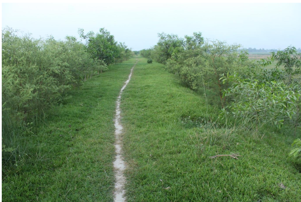
2015 B1 Plantation at Kolkala Khari Canal Bank Plantation under Balurghat FMU of Raiganj DMU