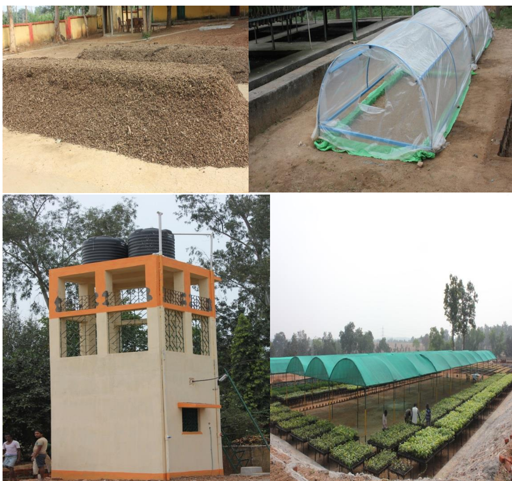
Establishment of New Central Nursery at Kenda under Kangsabati South DMU