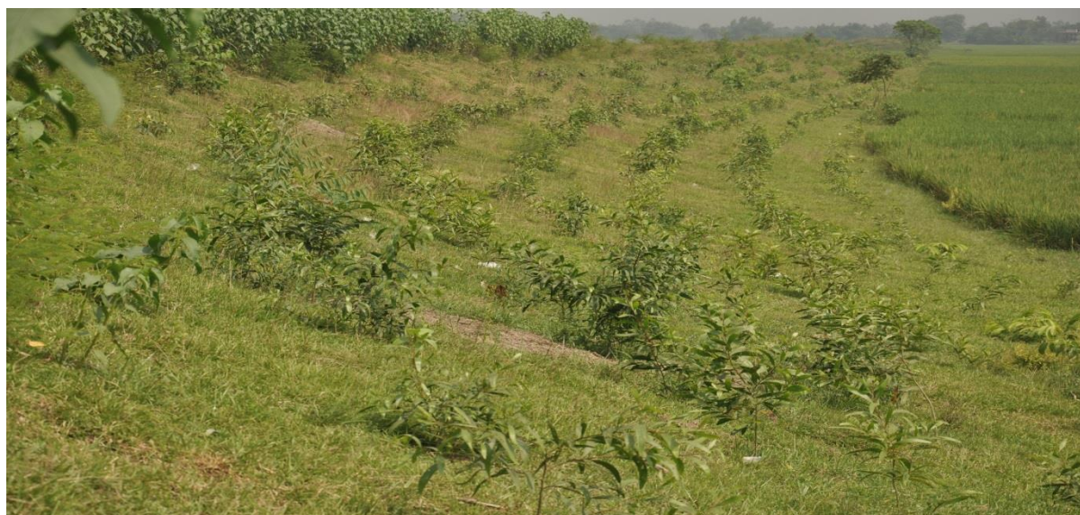
2015 Plantation under B1 Model of TPOFA from Abdulghata to Firozpur under Raiganj DMU