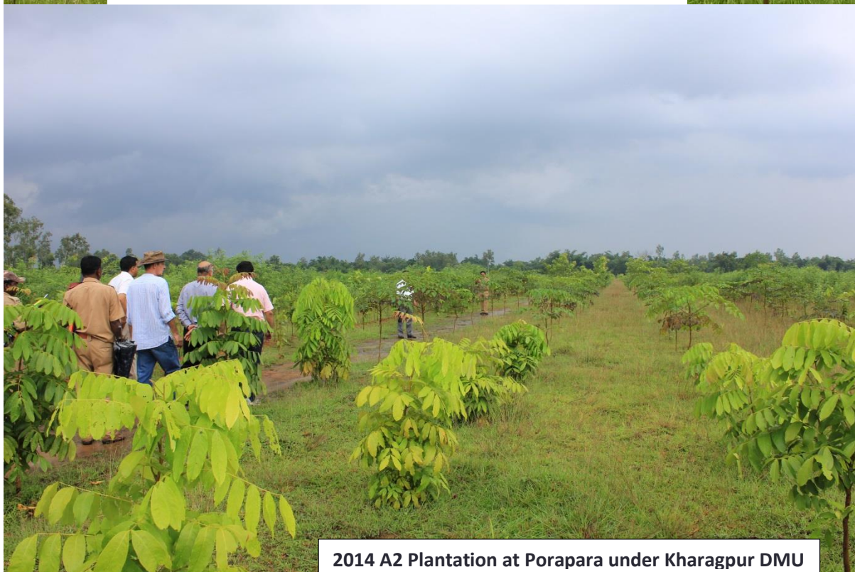
2014 A2 Plantation at Porapara under Kharagpur DMU