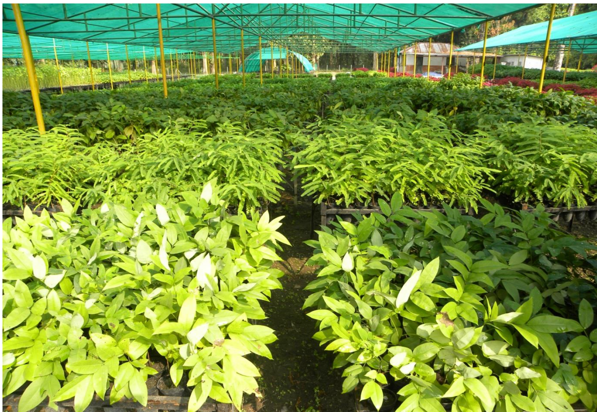
Establishment of New Central Nursery at Nilpara under Wildlife III DMU