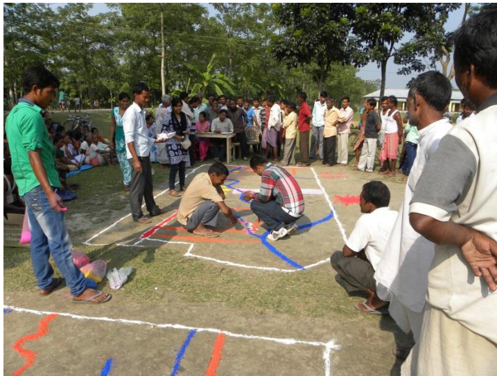
PRA Exercises as a prelude to preparation for Microplan at Jaldapara.