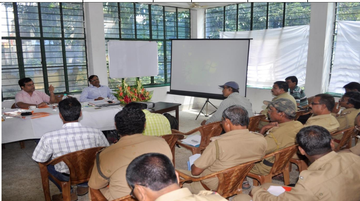
Training on Preparation of Microplan at Panagarh under Burdwan DMU