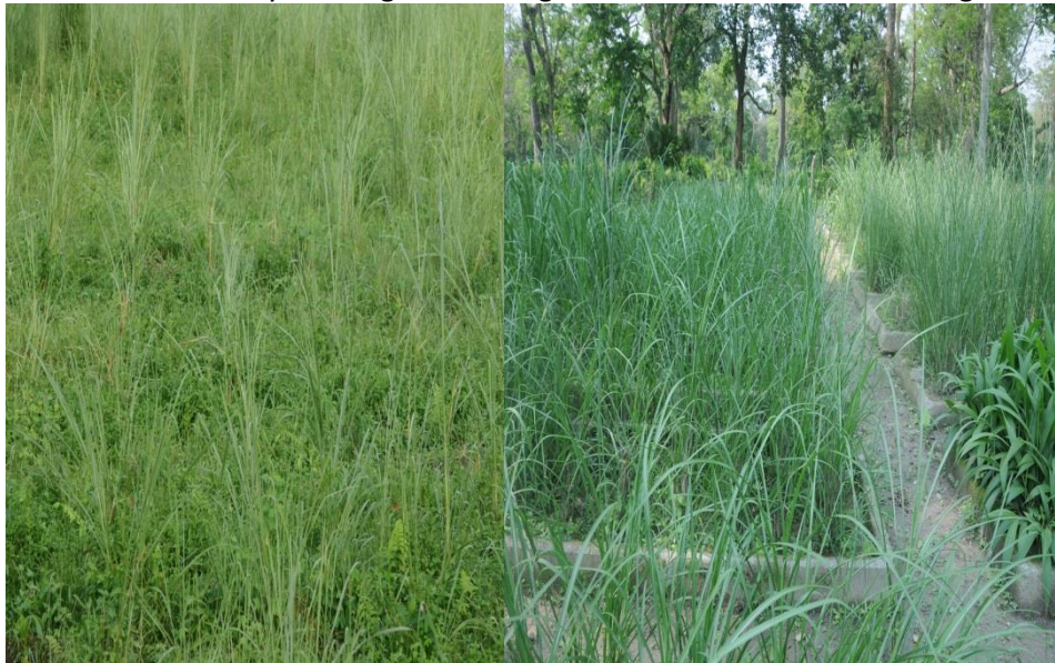
2015 Grassland Fodder Plantation at Jaldapara under Wildlife-III DMU

During FY 2015-16, Wildlife-III DMU was assigned to raise Grassland Fodder Plantation over 60 ha, while 40 ha of Grassland Fodder was allocated to Wildlife-II DMU. Wildlife-II DMU was also asked to raise Fodder Tree Plantation by working out Malling Bamboo areas over 5 ha during 2015-16.