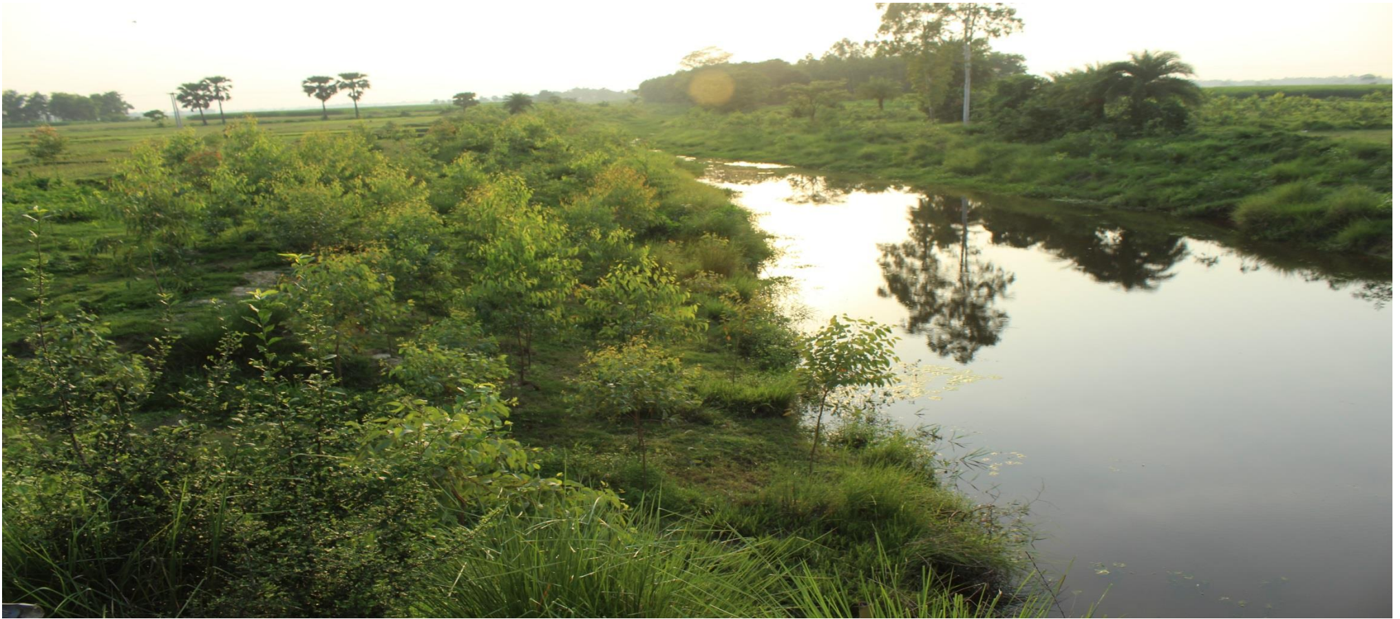
2015 B1 Plantation at Kolkala Khari Canal Bank Plantation under Balurghat FMU of Raiganj DMU