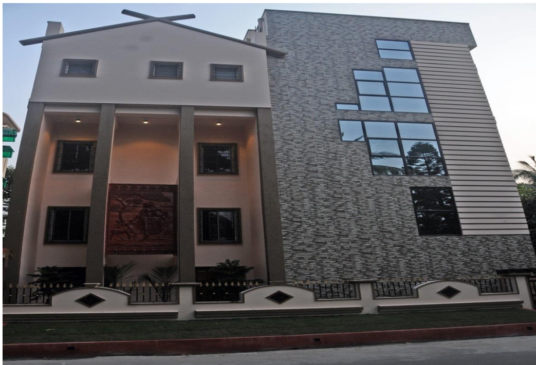
AE-391, Salt Lake

The construction of buildings for field staff is also under progress. 15 no. Group D quarters, 10 nos. group C quarters and 3nos. ROs quarters/Range offices were completed in 2015-16.