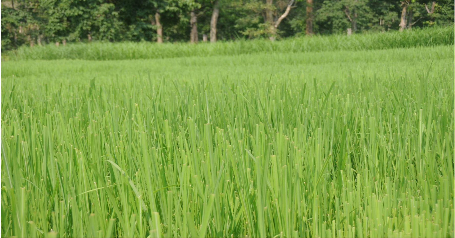
2016 Grass Fodder Nursery under Wildlife-III DMU