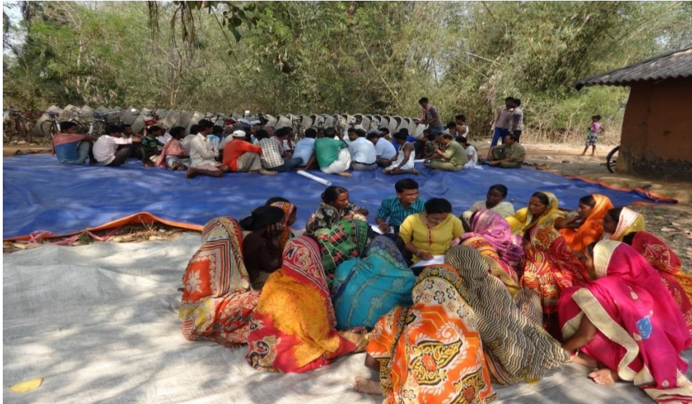
Microplan Training at Jhargram DMU