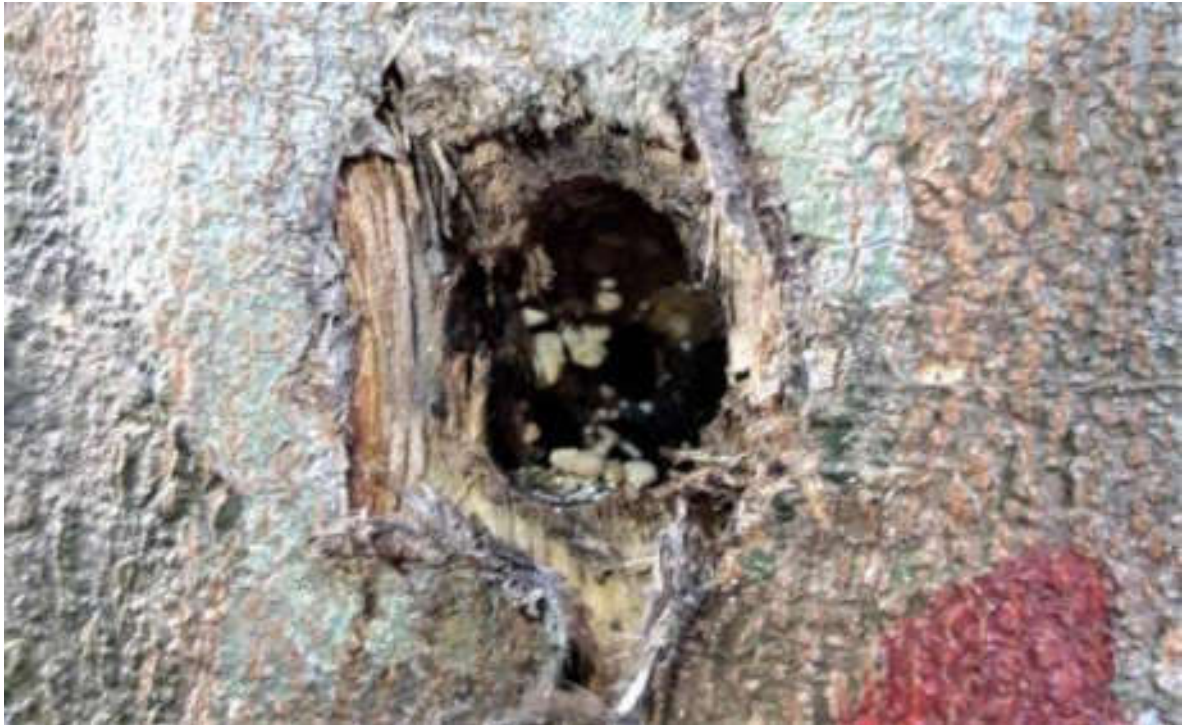
After six months of inoculation infection is spreading